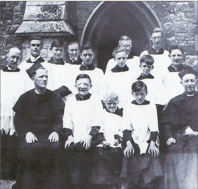
■ St Andrew's servers, circa 1950s