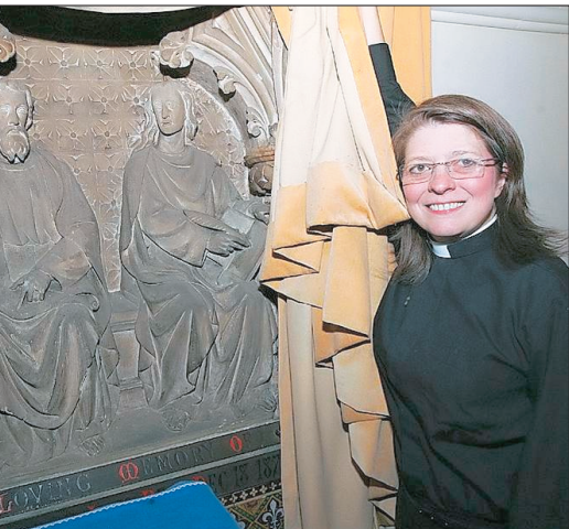
ose with the altar screen damaged during the war