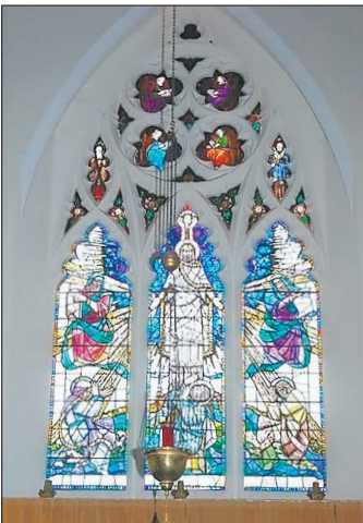
■ Replacement stained glass window