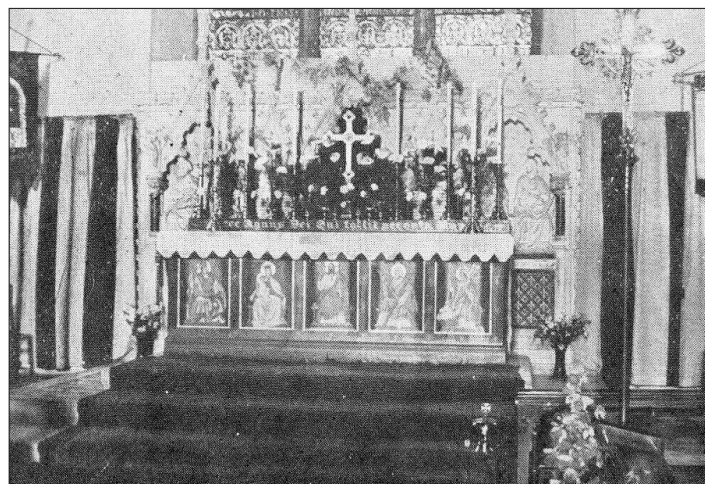
■ The altar before the Second World War blast damaged it